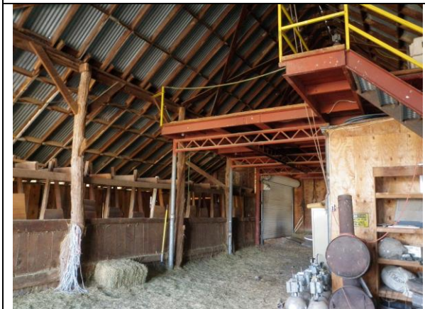
5. Barn interior, feeder, hay loft, roll up door to corrals