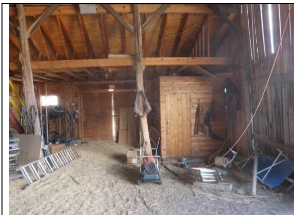
7. Tack room