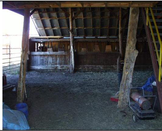
16. Barn interior