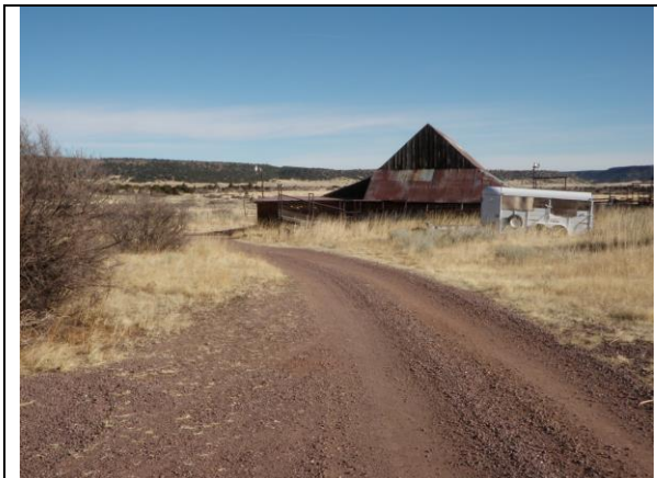
1. Barn, 40x70 with loft and garage