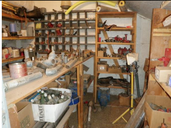
14. Storage room