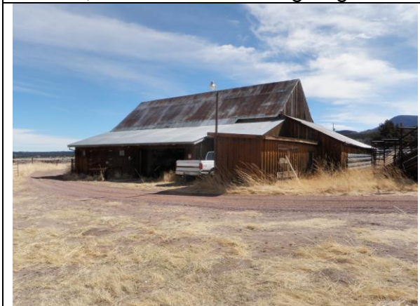
3. Barn, west side