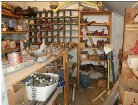
14. Storage room