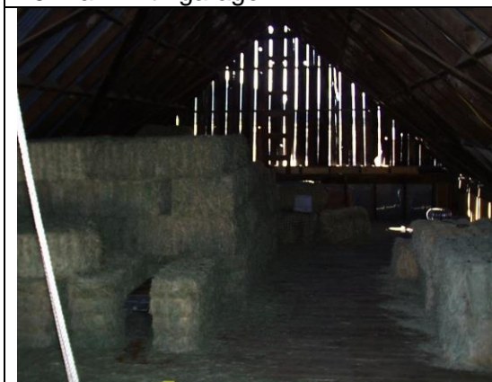
17. Barn second floor hay loft