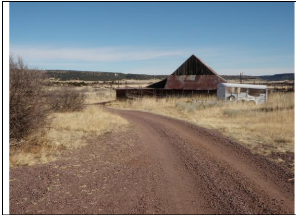
1. Barn, 40x70 with loft and garage