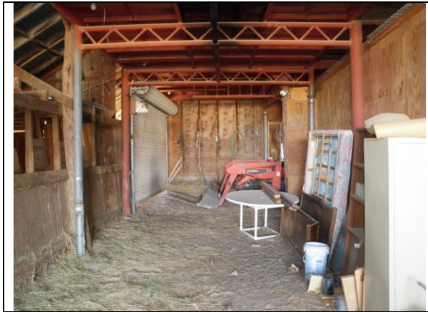
9. Storage space under loft