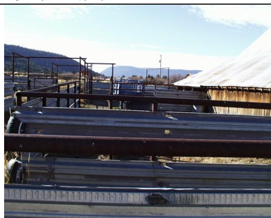
18. Corrals, pipe with metal sides