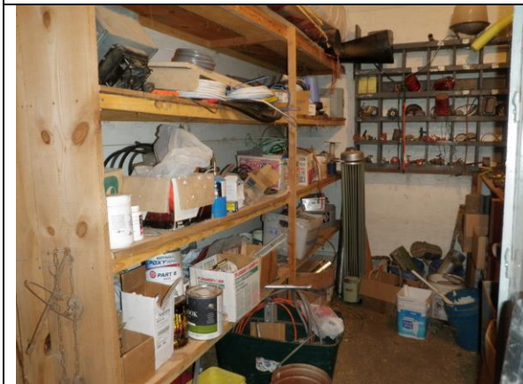
13. Storage room