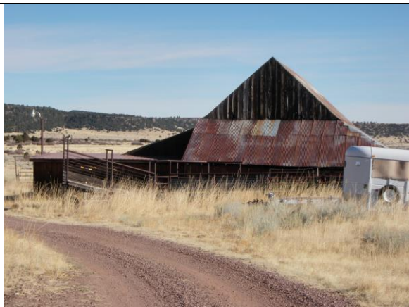
2. Barn, south side