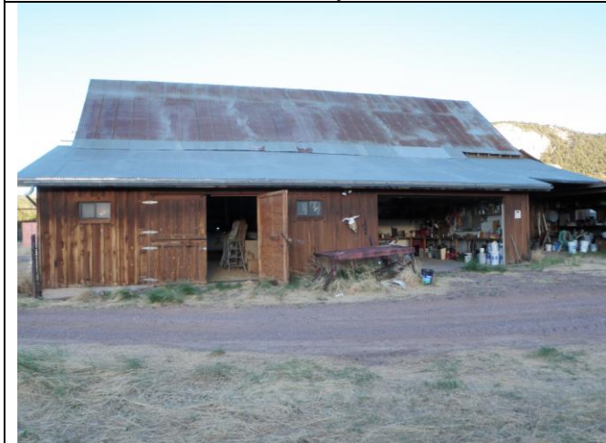
19. Barn west side with 2 car garage.