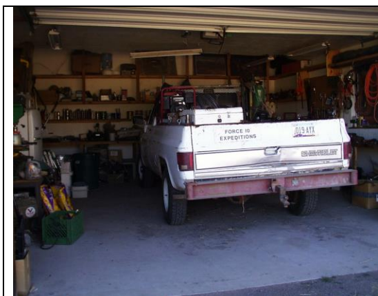
15. Barn with garage