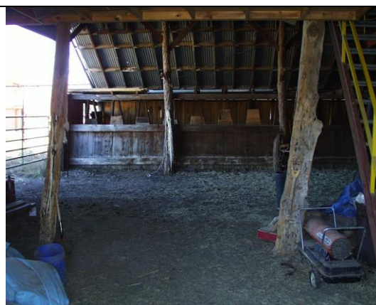
16. Barn interior