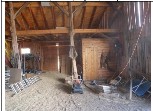
7. Tack room