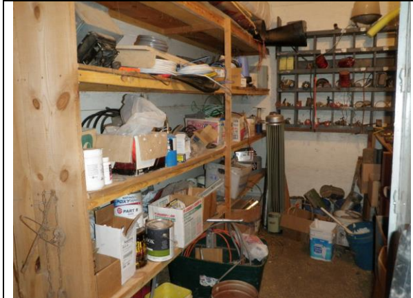
13. Storage room