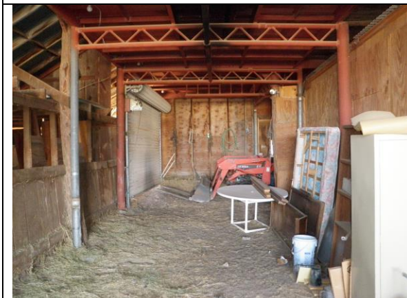
9. Storage space under loft