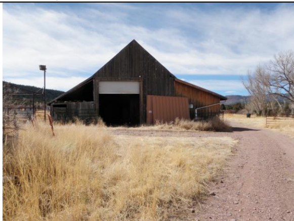
4. Barn, north side, 14 ft high x 12 ft wide roll up door