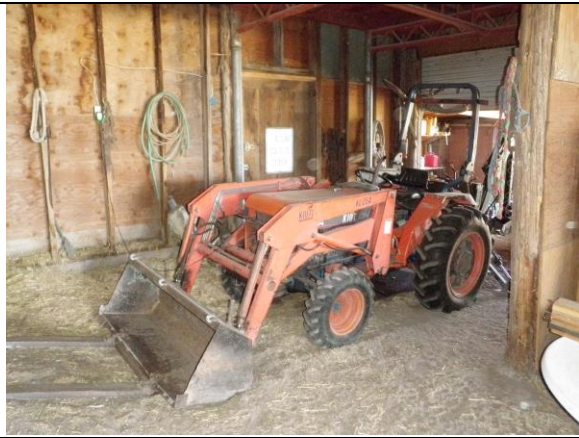
10. Equipment storage with roll up door