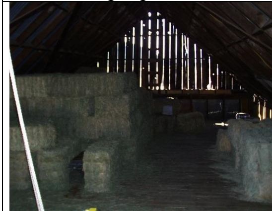
17. Barn second floor hay loft