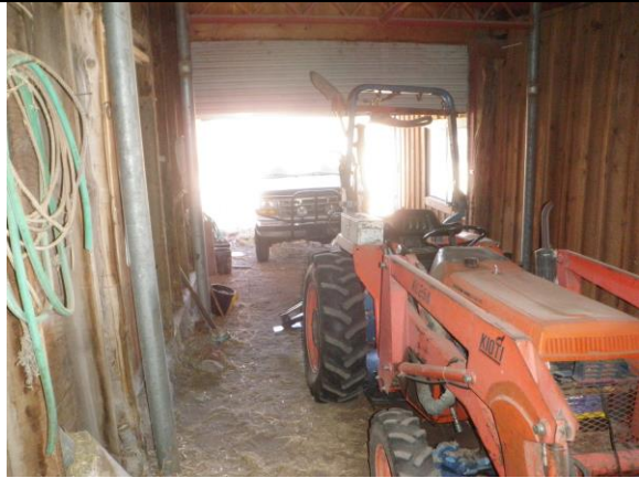
12. Roll up door on west side