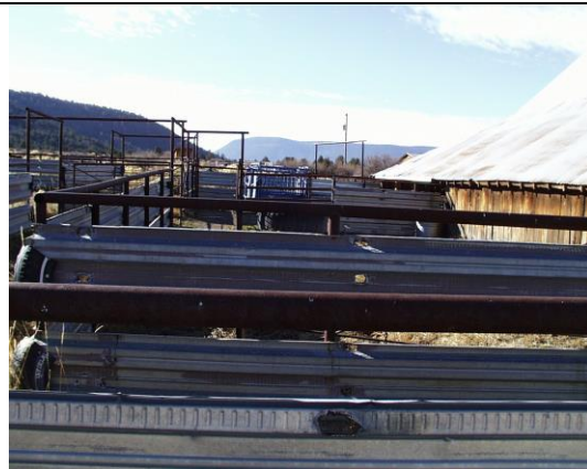
18. Corrals, pipe with metal sides