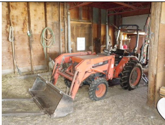
10. Equipment storage with roll up door