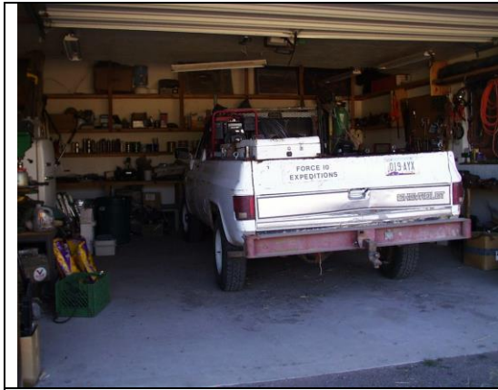
15. Barn with garage